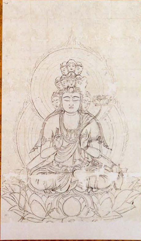
151 十一面観音図 (修理後) Ju-ichi-men Kan' non-zu (after restoration)