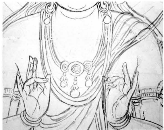
196 修理後 After restoration