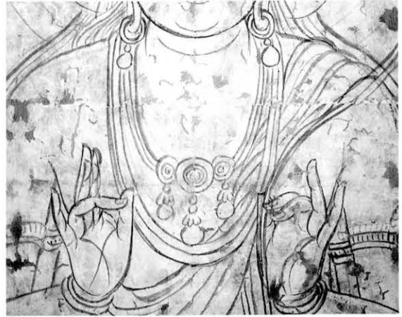
195 旧肌裏紙の除去後 After removing the old first lining