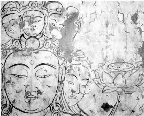
192 旧肌裏紙の除去後 After removing the old first lining