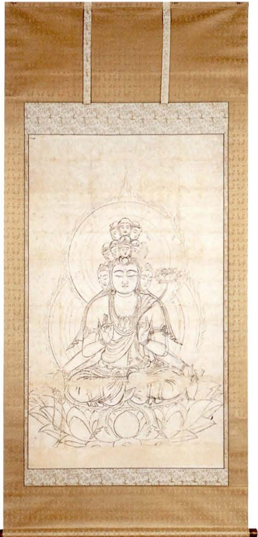
152 十一面観音図 (修理前) Ju-ichi-men Kan' non-zu (before restoration)