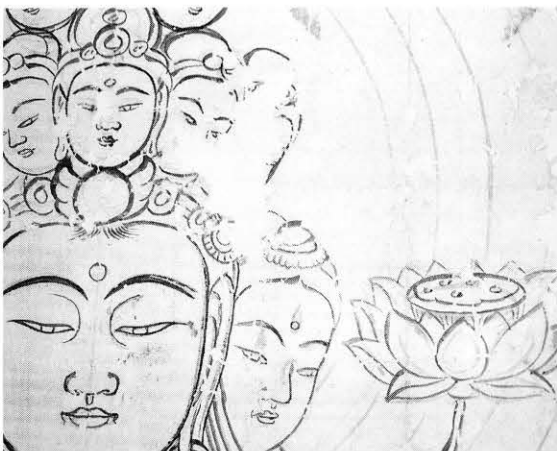
193 汚れ取り後 After cleaning