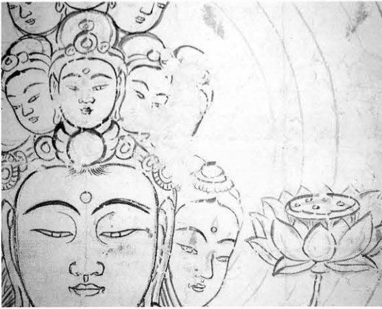
191 汚れ取り前 (十一観音図 修理前) Before cleaning ( Ju-ichi-men Kan'on-zu before restoration)