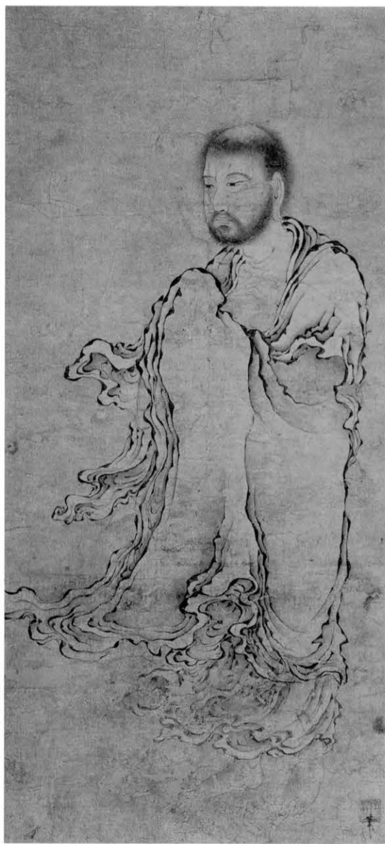
159 出山釈迦図 (修理後) Shussan Shaka-zu (after restoration)