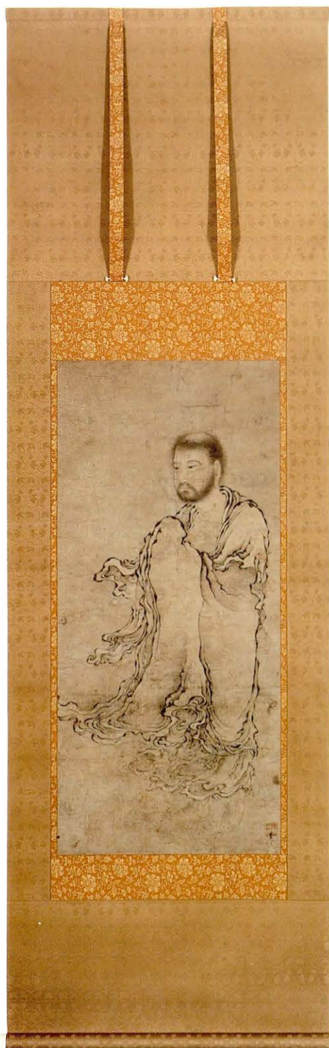
147 出山釈迦図 (修理後) Shussan Shaka-zu (after restoration)