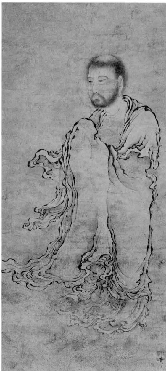
160 出山釈迦図 (修理前) Shussan Shaka-zu (before restoration)